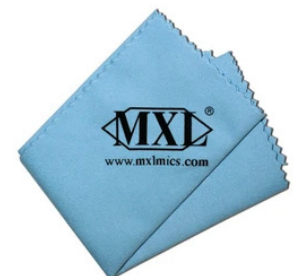
Microfiber Cleaning cloth